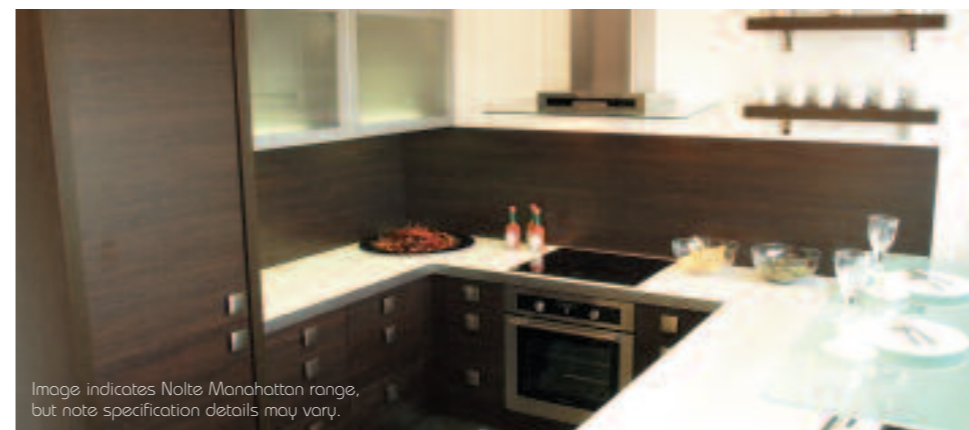
Image indicates Nolte Manhattan range, but note specification details may vary.